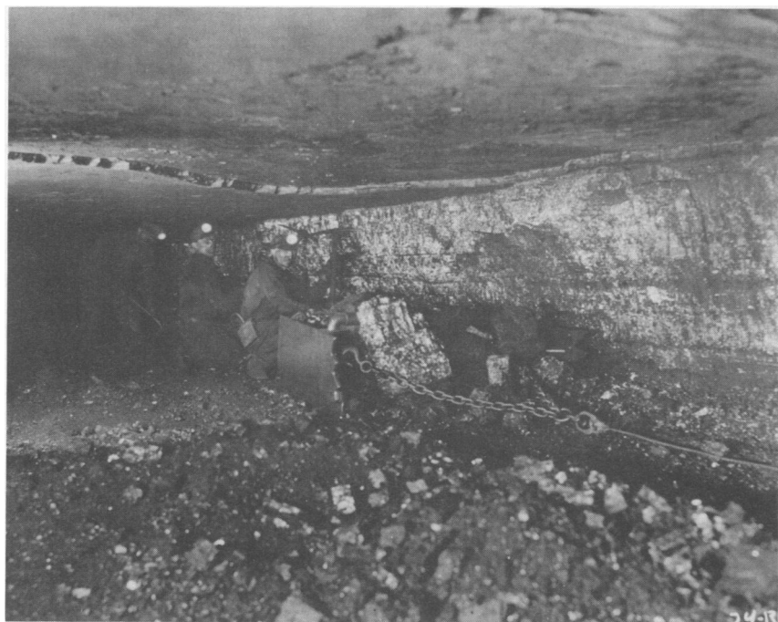
Coal miners at work in Rossiter, Pennsylvania (no date).